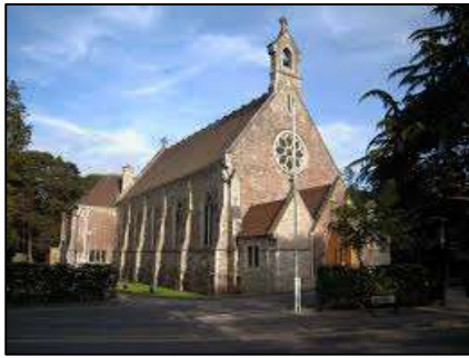
All Saints' Church, Branksome Park