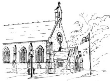
All Saints' Church, Branksome Park